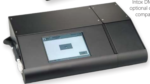
Intox DMT with optional dry gas compartment