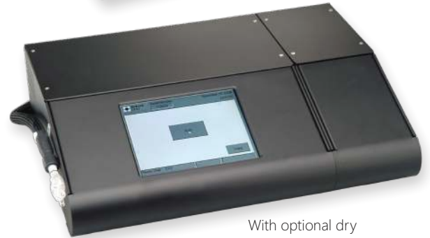
With optional dry gas compartment