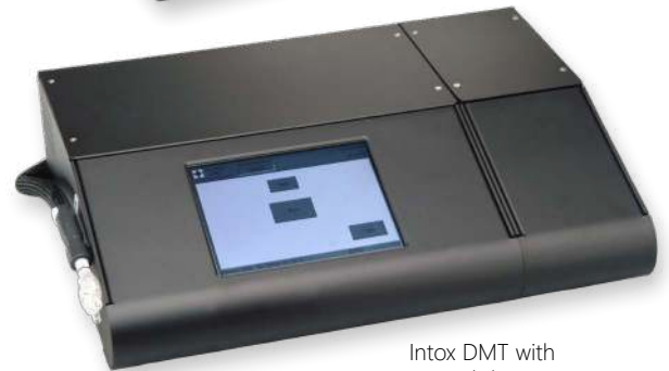
Intox DMT with optional dry gas compartment