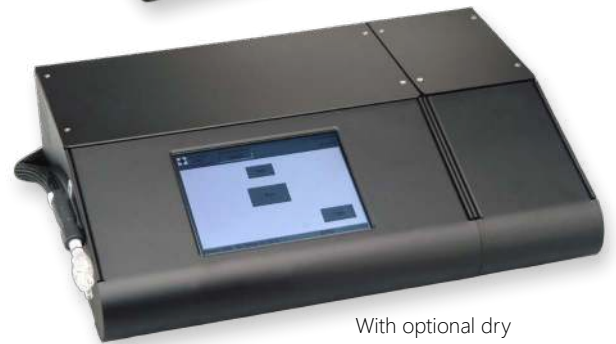
With optional dry gas compartment