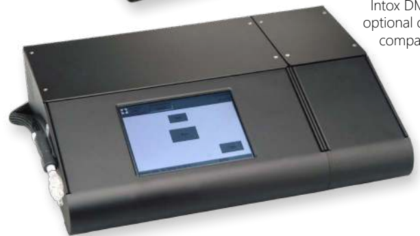
Intox DMT with optional dry gas compartment